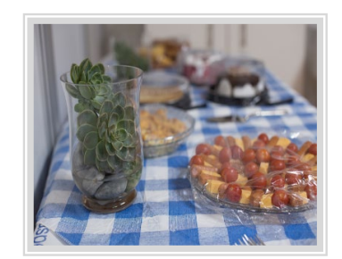
Photo 1: The venue used for the World Café. Tables were decorated and arranged in café style. Refreshments were offered. (Photos taken with consent of the participants)