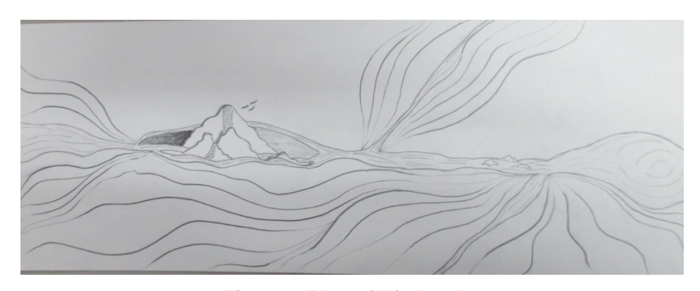
Figure 1: River of Life drawing

Figures 1 and 2 are examples of the River of Life drawings of the first-year group.