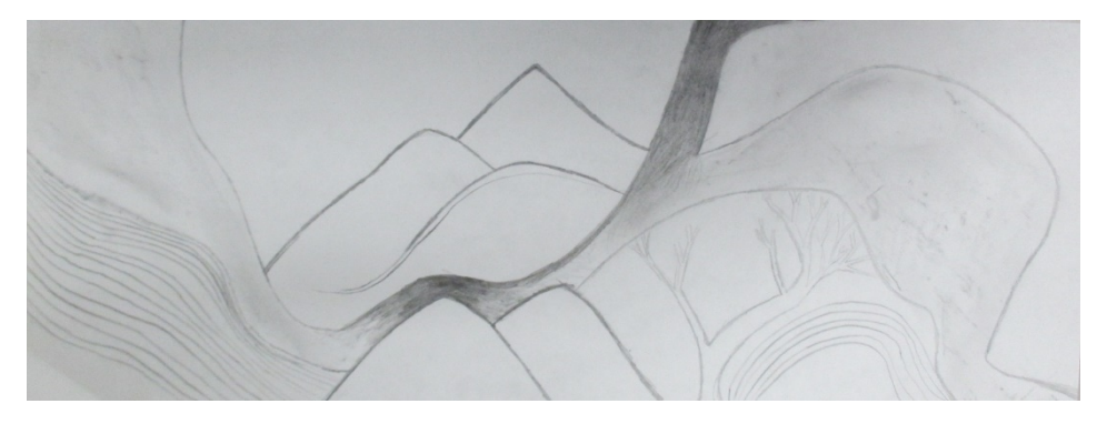
Figure 2: River of Life drawing

During the following session, each student selected an interesting section from the drawing to enlarge, like a blow-up, on an oblong grey sugar paper, this time drawing in white pastel. These enlargements (Figure 3) were used as surfaces for applying a colour mixing exercise. First-year students were applying the art elements in a calm and natural manner, without any realistic depiction expected from them. Due to the fact that their own personal course of life stories, as depicted in the River of Life drawings were the points of departure, they remained focussed while exercising and applying media that they could utilize in their teaching practice once they were teachers at schools.