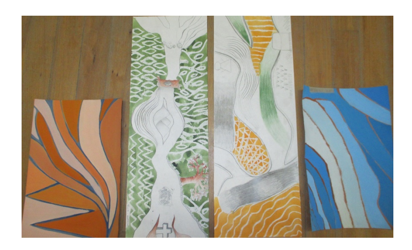
Figure 3: Examples of the application of the art elements in mixed media

During the following session, each student selected an interesting section from the drawing to enlarge, like a blow-up, on an oblong grey sugar paper, this time drawing in white pastel. These enlargements (Figure 3) were used as surfaces for applying a colour mixing exercise. First-year students were applying the art elements in a calm and natural manner, without any realistic depiction expected from them. Due to the fact that their own personal course of life stories, as depicted in the River of Life drawings were the points of departure, they remained focussed while exercising and applying media that they could utilize in their teaching practice once they were teachers at schools.