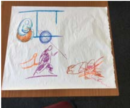
Figure 7: Exercise ball generating comfort compared to pain in forced positioning

out of the space that later became still and silent, leaving a grieving mother alone with her loss. The student was denied the opportunity to be compassionate and caring.