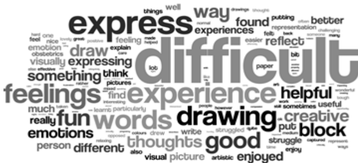
Figure 5: Word cloud representing student feedback on drawing task

Figure 3 was created in class by her kind colleague, assisting her by drawing a perineum with a 4th degree tear – an avoidable complication caused by the limited expertise and apparent lack of compassion of the midwife. Later in our focus group this student confronted a large sheet of A0 paper and, with marked determination and desire, added her sketch – with the events unfolding and becoming visible through the force of the coloured markers which connected with the paper through images and annotations, as indicated in Figure 4. Through email communication and also at a chance meetup in a shopping mall, this student thanked me for the opportunity to share and unload her burden. She wrote ‘it’s good that there are people like you who actually take time to figure out issues that can be resolved’ (email communication September 2015).