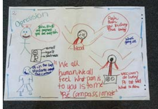
Figure 4: Multiplicity of pain felt by student

Figure 3 was created in class by her kind colleague, assisting her by drawing a perineum with a 4th degree tear – an avoidable complication caused by the limited expertise and apparent lack of compassion of the midwife. Later in our focus group this student confronted a large sheet of A0 paper and, with marked determination and desire, added her sketch – with the events unfolding and becoming visible through the force of the coloured markers which connected with the paper through images and annotations, as indicated in Figure 4. Through email communication and also at a chance meetup in a shopping mall, this student thanked me for the opportunity to share and unload her burden. She wrote ‘it’s good that there are people like you who actually take time to figure out issues that can be resolved’ (email communication September 2015).