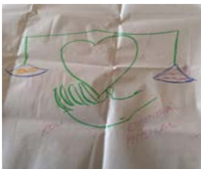
Figure 9: Seeking balance

Figure 9 drawn by a midwife educator illustrates the challenge of a socially just pedagogy in finding a balance between issues of the soul with the provision of information and skills (interview midwife 2015). This questioning is also put forward by Lenz Taguchi and Palmer (2014, 770) who ask ‘[h]ow can we be productive of positive desire in the production of knowing?’.