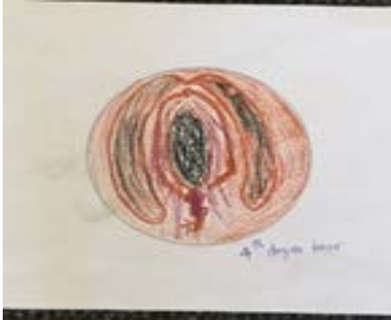
Figure 3: Site of obstetrics violence

pastels-student assemblage felt disempowering. This student explained that she was too angry to draw as a result of a traumatic experience she had witnessed. A vacuum delivery was performed on a ‘petrified 15 year old girl’ who was given no explanations. The force of the material exacerbated her sense of helplessness and anger.