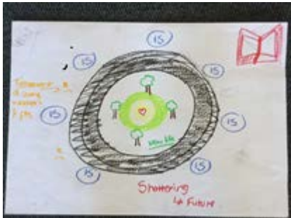
Figure 1: Curricular constraints

In terms of curricular tensions, the drawings in Figures 1 and 2 emerged from students' thinking during a classroom workshop (then explained by the students during a focus group a few weeks later). These drawings provide a small sample of the material-discursive intra-actions that constitute students' learning experiences in their journey to becoming doctors.