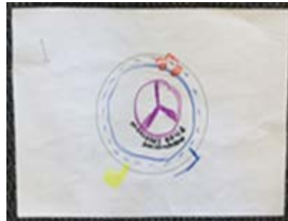
Figure 2: Speeding to catch deliveries

In Figure 1 the student first acknowledged the central joy of birthing. However, this was suppressed by the darker curricular imperative for 15 deliveries and other deliverables of the designed curriculum. The drawing demonstrates how the students' agenda and desire to achieve the required sign-offs (the curricular imperative for accountability and a prerequisite for progress to the next stage in the curriculum) became a noose-like constraint that restricted this student's response to unjust practices – a thread of tension arising from other drawings and workshop conversations.