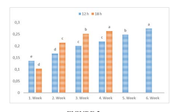
FIGURE 2 MDA (nmol)

This study aimed to examine the weekly course of high temperature stress in the Narince grape variety. The greenhouse effect caused by the CO_2 released into the atmosphere since the industrial revolution has been observed to have effects of high temperature, which pose