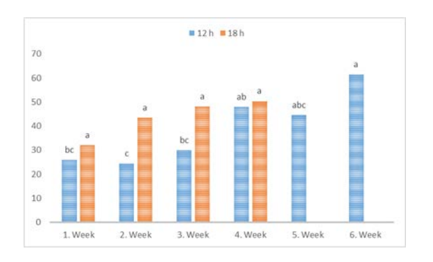
FIGURE 1 Ion flow (%)

MDA is a biochemical that tends to increase under many stress factors. Wang et al. (2004) and Topcu Altinci (2016) have mentioned the increase in the amount of MDA under the conditions of high temperature stress to which they submitted grape varieties. MDA (lipid peroxidation) is an analysis method used in the biochemical evaluation of the stress factor in many stress studies. Lipid peroxidation can be viewed as the end product of essential cell membrane reactive damage to cellular mechanisms (Ali et al., 2005; Liu et al., 2006), and the MDA content is an important indicator of the extent of membrane lipid peroxidation. Most importantly, the accumulation of MDA can further damage the membrane and cells (Chen, 1989). These results show that high temperature stress causes significant increases in MDA and ion flow. In his study, Topcu Altıncı (2016) reported that the damage increased by showing the increase in MDA and ion flux values with the increase in heat stress. According to Xiao et al. (2017), high heat stress applied to