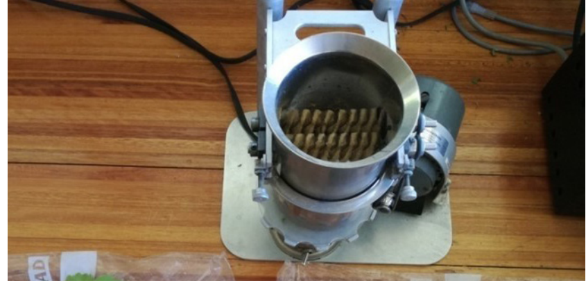
FIGURE 1 The Leedom engineered leaf brushing machine.

Spermatheca (Fig. 2 (4); Table 1): Calyx saccular with distal half thick walled 15 (15-16). Atrium incorporated in calyx.