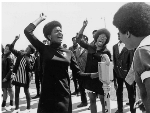
Figure 6. Black Panther Party members rally in 1968 (Anonymous, 2011)

Lester (2000: 205) describes how many African women used head scarfs or “kerchiefs” to hide their hair from the slave masters and their feelings of inferiority towards their hair was further exacerbated when they had to take care of the White masters’ children and comb their hair (see Figure 5.). This resulted in black women rejecting their own children’s hair. The desire to conform to Eurocentric standards of beauty was passed down through many generations in black communities. In 1905, hair styling tools such as the straightening comb and a wide range of hair care products were first introduced in African American communities by Madam C. J. Walker, a black woman who revolutionised the black hair care industry in America (Lester, 2000). These tools and products influenced black women to internalize racial notions of hair by accepting that long, silky, straight hair or ‘good hair’ was an ideal worthy of admiration. The desire for ‘good hair’ in the black communities becomes not only a question of beauty but an issue of maintenance. ‘Bad hair’ is difficult to comb and requires straightening, while ‘good hair’ is associated with both beauty and minimal maintenance. However, methods to achieve ‘good hair’ have health implications when used for prolonged periods of time through the use of relaxers and the harmful chemicals found in it.