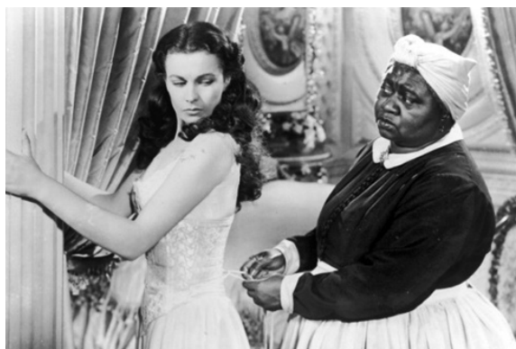
Figure 2. Mammy women were usually dressed to be a representation of their master's wealth (Anonymous, 2014)