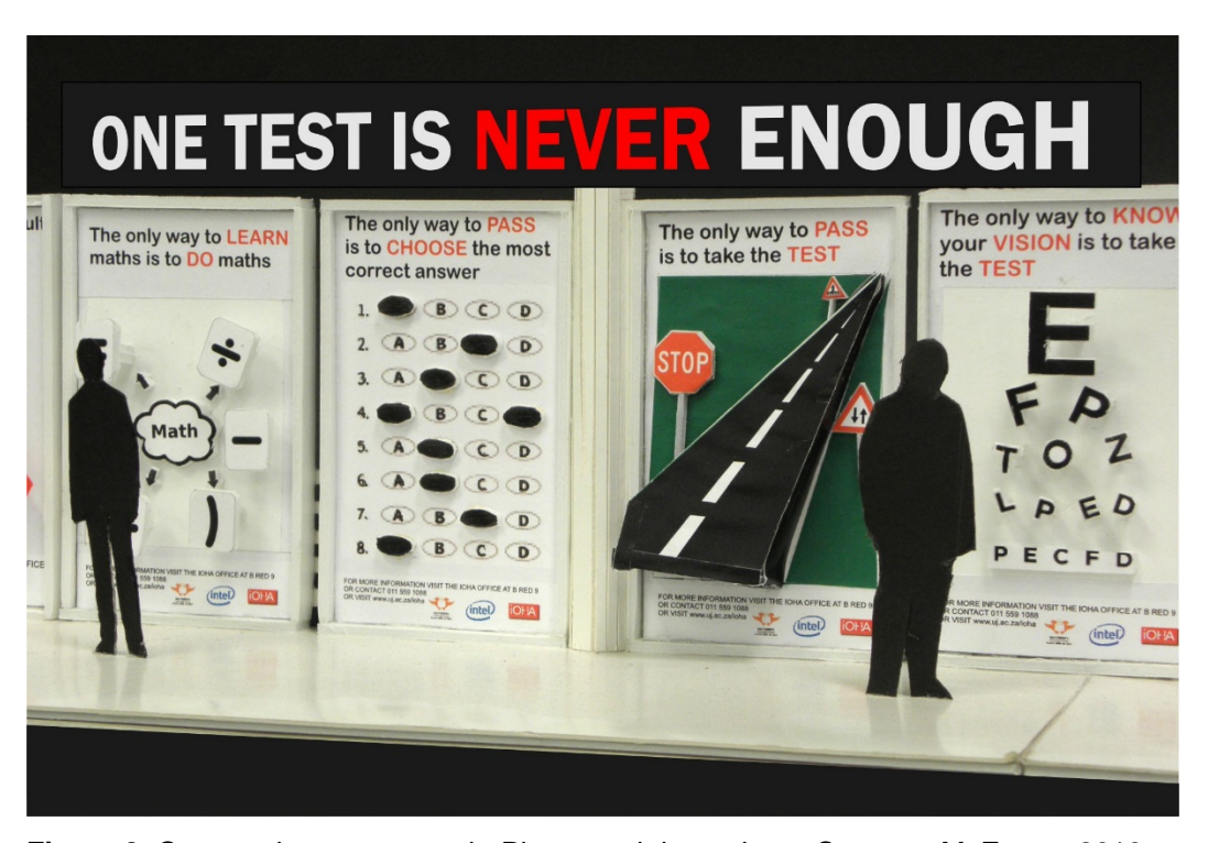
Figure 3: One test is never enough.

fortune-tellers that are marked with information. The intervention also incorporated the IOHA-branded 'paper fortune-tellers' with information, which could be taken home. The use of a variety of media to enhance user-engagement extended the installation such that viewers could play and later reflect on the topics both on-site and in their own personal space.