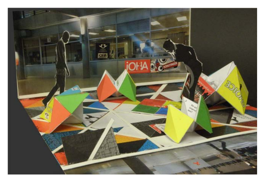
Figure 2 : Choice.

fortune-tellers that are marked with information. The intervention also incorporated the IOHA-branded 'paper fortune-tellers' with information, which could be taken home. The use of a variety of media to enhance user-engagement extended the installation such that viewers could play and later reflect on the topics both on-site and in their own personal space.