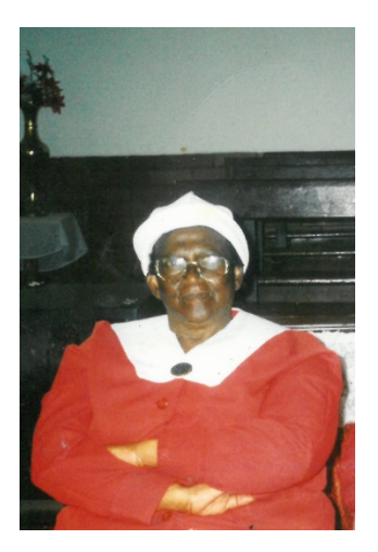
Figure 3: A photograph of my mother wearing Methodist church uniform

A value that emerged from my mothers' personal mentoring was kindness. When my father passed away, relatives demonstrated kindness by helping with our education. I recall how my relatives would come and visit us during the holidays. When they came to visit us they would bring something which we could all share as a family. I consider that as kindness, which I learned and I now offer assistance when it is needed. These values "resonated with understanding of what is right or not" (Wood 2014, 44). The value of kindness is a guiding light for me as it was very much part of my personal mentoring.