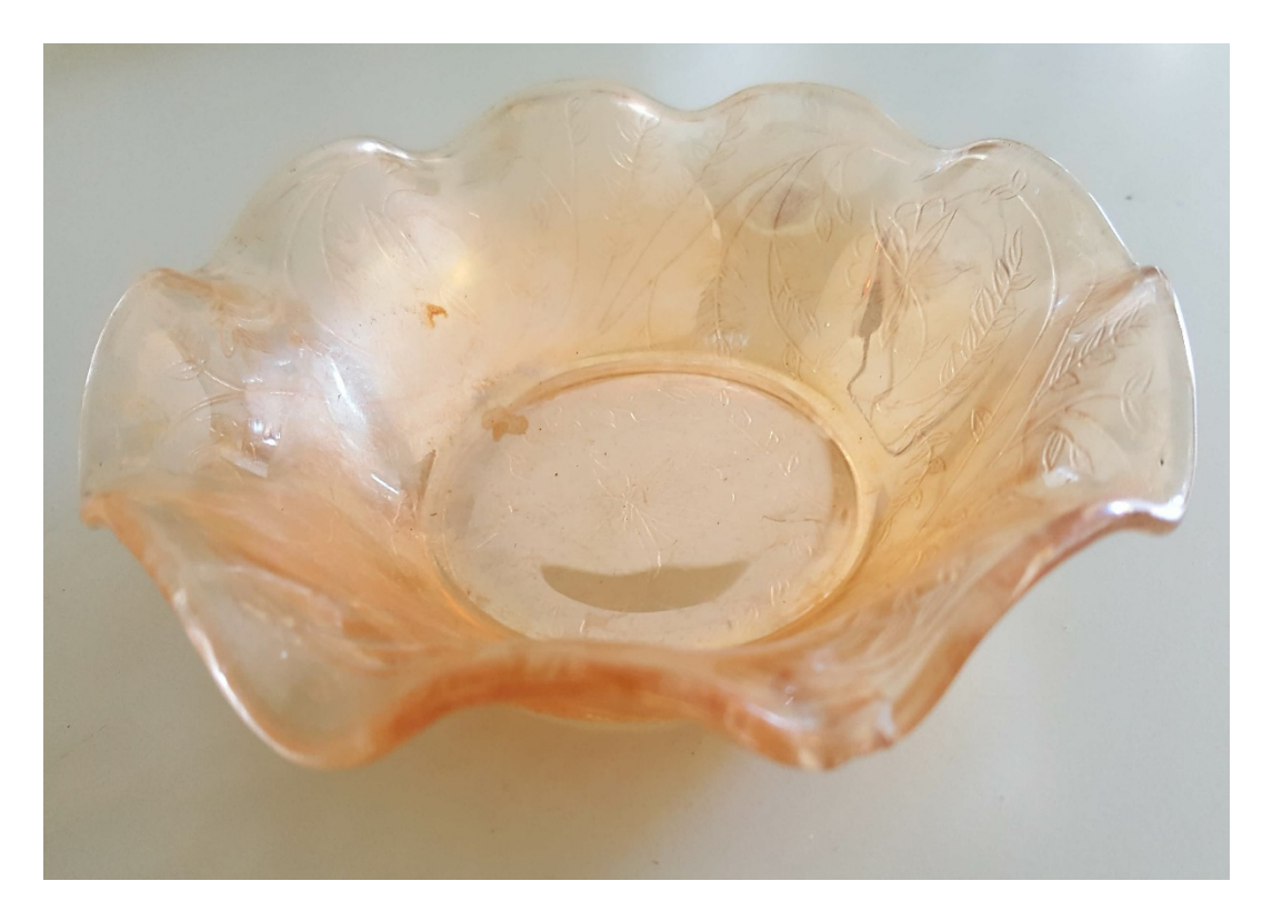
Figure 2. The dessert bowl: An object that represents my father's mentoring

There is a special object that has been around at home since I was a child. The object is a dessert bowl. I was told by my mother that when she met my father he placed a set of bowls in his room. There were originally six dessert bowls, but only two remain. One of the bowls is depicted in Figure 2.