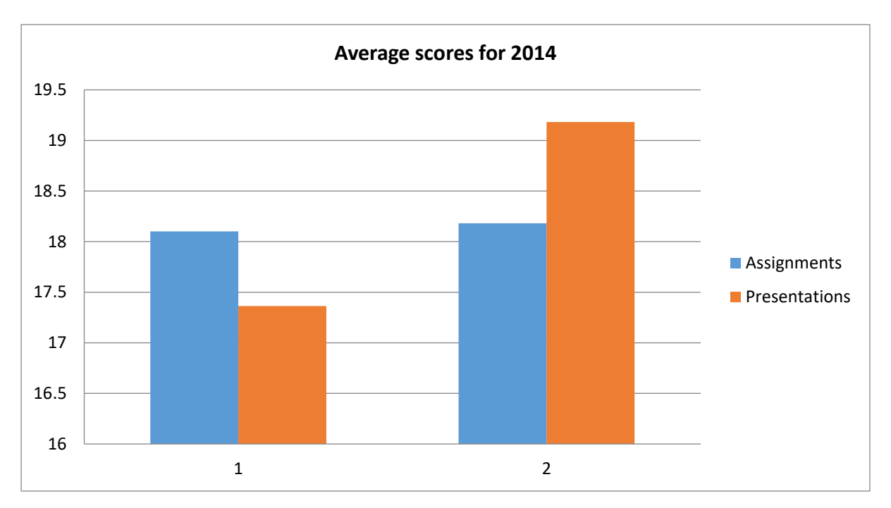
Figure 3: Group average scores of written assignments and oral presentations for 2014

presentations in the period under review in the first semester. In the second semester, the average scores for written assignments are higher than those of oral presentations.