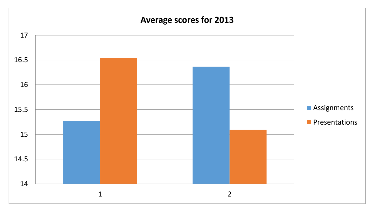
Figure 2: Group average scores of written assignments and oral presentations for 2013

Figure 1 presents group average scores for both written assignments and oral presentations for the first and second semester. Student scores for written assignments are slightly higher than that in oral presentations in the first semester while the opposite is the case in the second semester. However, these scores are relatively high in the second semester.