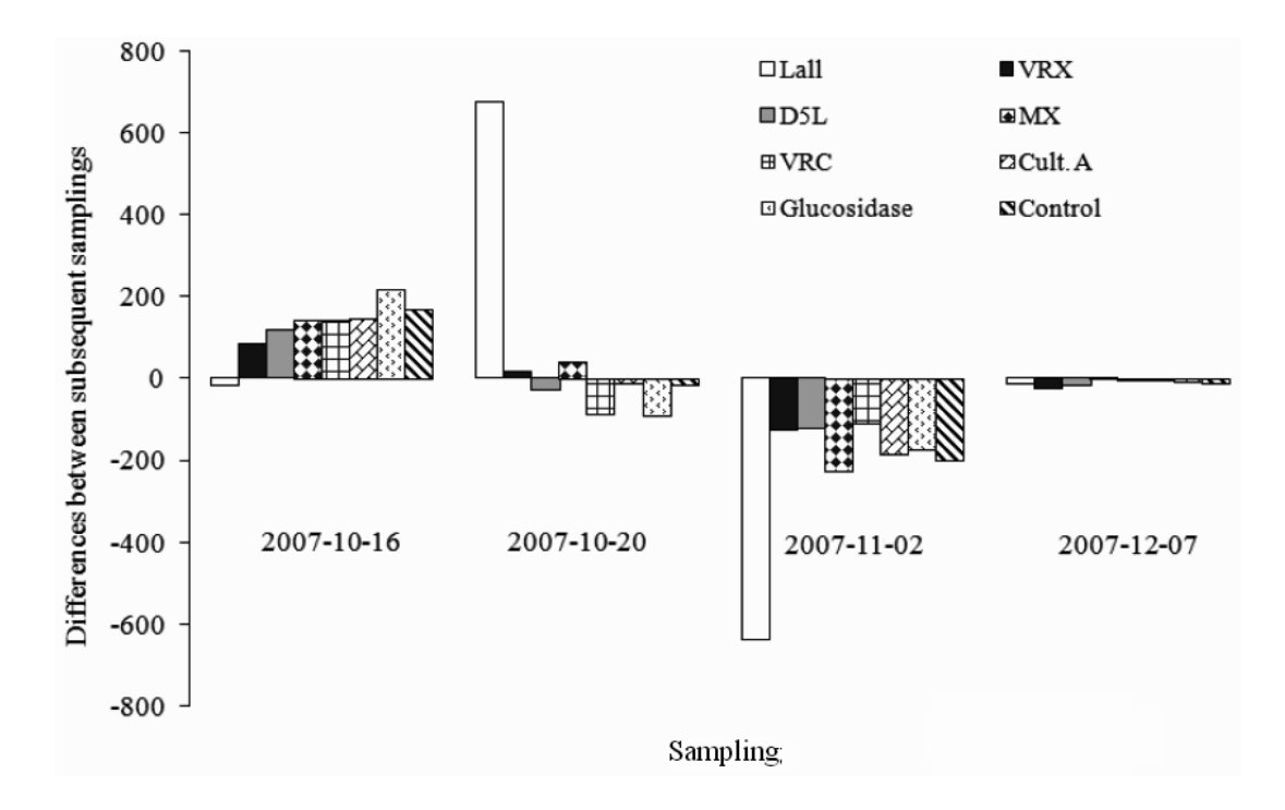
The average content of total monoterpene compounds (TMT; \mu g/L) in musts and wines from Gewürztraminer during vinification, according to enzyme treatments. The standard error bars are given at each data point. The must and wine treated with the Lall enzyme preparation showed statistically significant differences in TMT contents at p < 0.001, based on the Duncan test.