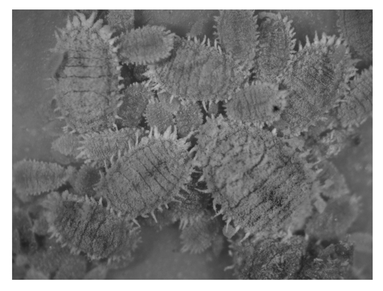
FIGURE 1 A colony of female Planococcus ficus .

in the Middle East, Pakistan, South America, California, the Mediterranean region, Mexico, Europe and North Africa, among other areas (De Villiers, 2006; De Villiers & Pringle, 2007; Daane et al. , 2008).