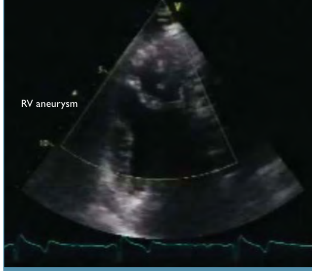
FIGURE 4: Echocardiogram of the right ventricle demonstrating the proximal RV aneurysm

with soft tissue. The right ventricular free wall measured between 1,5 and 2 millimetres in thickness and diffuse fatty infiltration was evident (Figure 5).