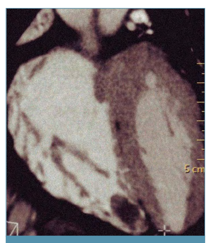
FIGURE 5: CT scan of the heart demonstrating fat infiltration of the RV free wall and an inhomogenous RV apical mass arising from

In view of the thin walled right ventricle free wall cardiac surgery was preferred over endomiocardial biopsy in order to determine the nature and histology of the right ventricular apical mass. The possibility of the mass being an organised thrombus was considered in the differential diagnosis on the echocardiographic