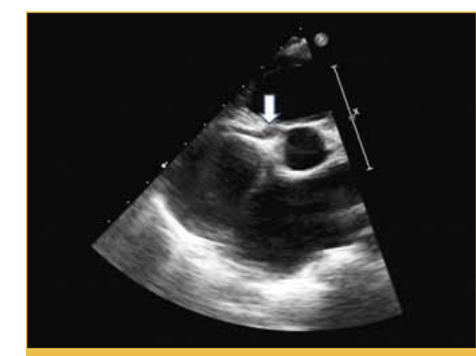
FIGURE 5: Parasternal short axis view of proximal RCA

In addition 15% of children present with "incomplete" KD and CAA. These children do not fulfil the classic criteria but exhibit echocardiographic features of CAA. This is more common in young infants who are also at highest risk of CAA. Hence referral for echocardiography should be considered in all children with unexplained fever for 5 or more days with or without any of the principal clinical features of KD especially in the presence of supportive laboratory evidence such as elevated ESR, CRP, liver enzymes and bilirubin, low albumin, sterile pyuria and aseptic meningitis.<sup>(2)</sup>