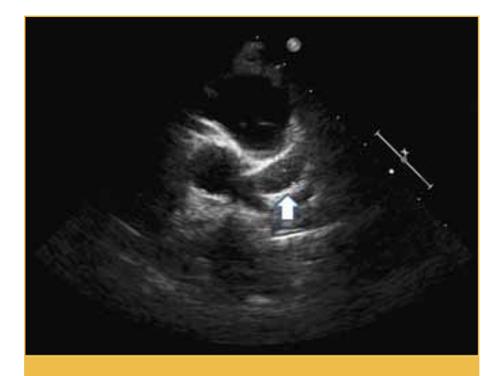
FIGURE I: Parasternal short axis view of LAD fusiform

The recently published RAISE study<sup>(7)</sup> demonstrated reduced CAA in Japanese children with severe KD (defined using a validated risk score)<sup>(8)</sup> treated with adjuvant corticosteroids in addition to the standard regimen. However, the difficulty lies in identifying early which children are likely to be IVIG-resistant (and hence at a greater risk of developing CAA) in the South African context since these children would likely benefit from adjunctive corticosteroids. The Japanese scoring system has low sensitivity in North American populations<sup>(9)</sup> so may equally not be applicable in our setting.