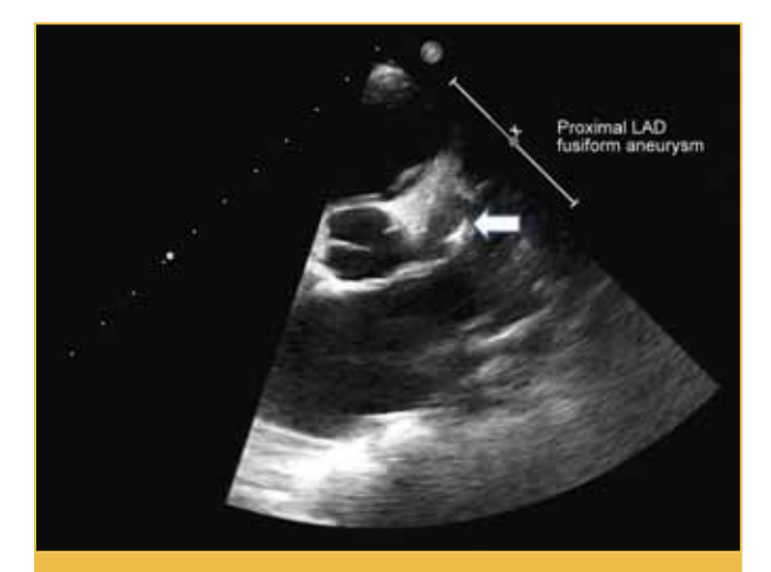
FIGURE 4: Parasternal short axis view of proximal LAD fusiform aneurysm in Case 2