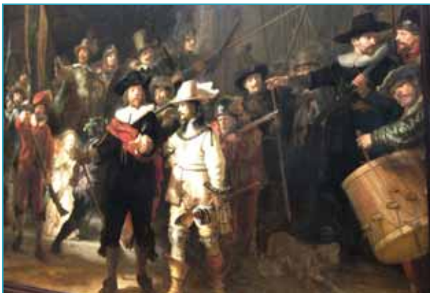
The painting, The Night Watch by Rembrandt van Rijn.

ESC 2013 was hosted in Amsterdam with over 30 000 delegates attending. I arrived a day ahead of the conference and took time to visit the Rijksmuseum. The timing was perfect as it had recently been renovated. The highlight