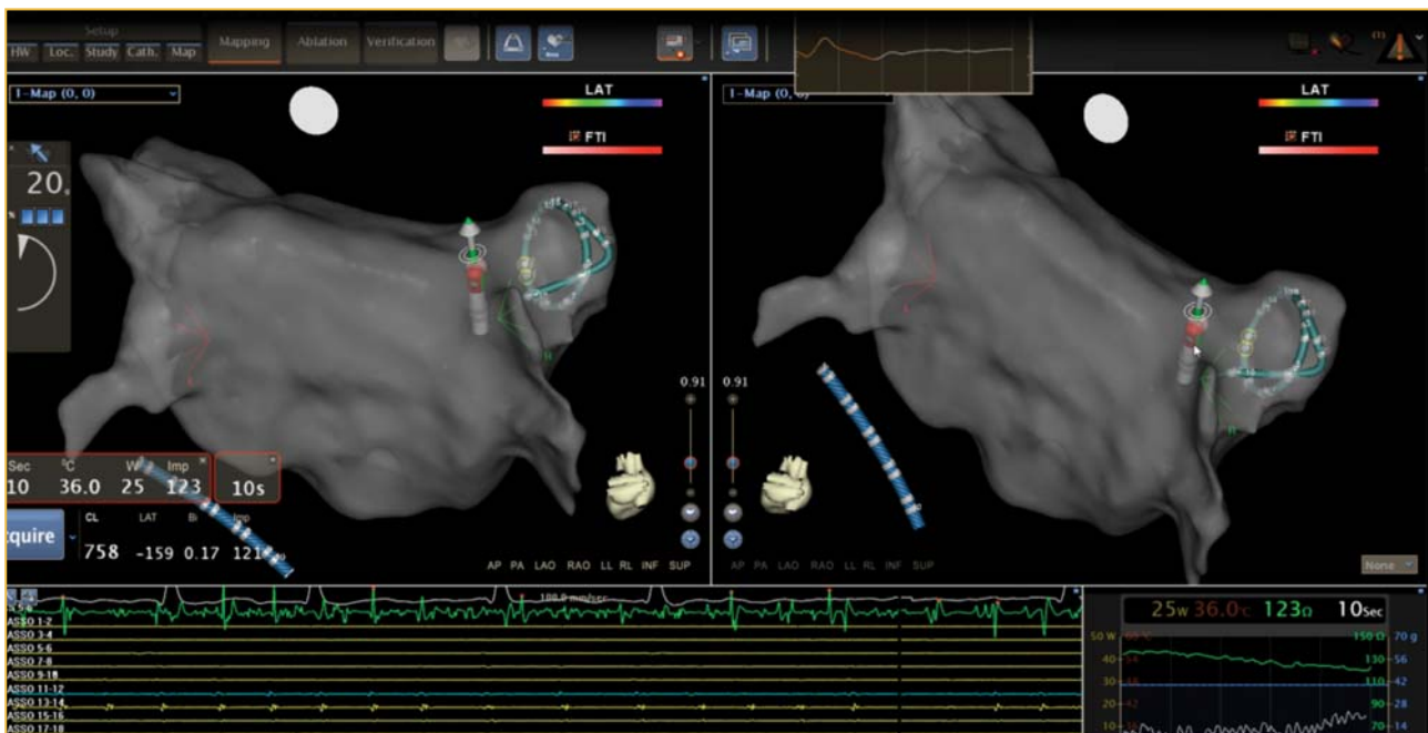
FIGURE 1: Different strategies to AF ablation

Both radiofrequency catheter and cryoablation strategies have been associated with major complications including death, stroke, pulmonary vein stenosis, atrio-oesophageal fistula formation and phrenic nerve injury, amongst others. A recent