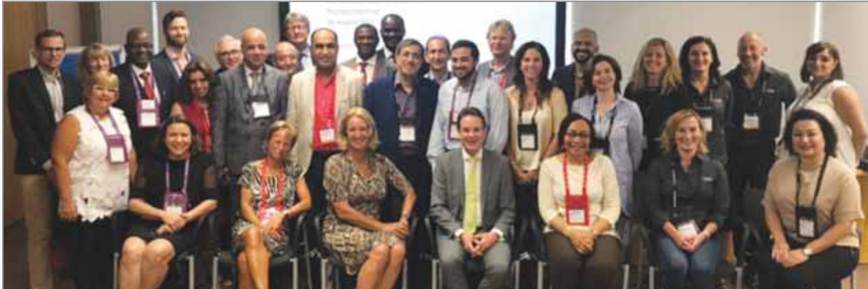
PPCM Investigators meeting at ESC Congress 2017, Barcelona.

Structural Heart Disease in Pregnancy" in poster form and thereby gain valuable feedback from leading experts in this particular field. Not only was this a great opportunity to gain recognition for our research and institution, but it also allowed for networking with other professionals interested in the field of cardiovascular disease in pregnancy. In particular, I made connections with those wishing to collaborate with our institute in the future as we have a unique cohort of subjects.