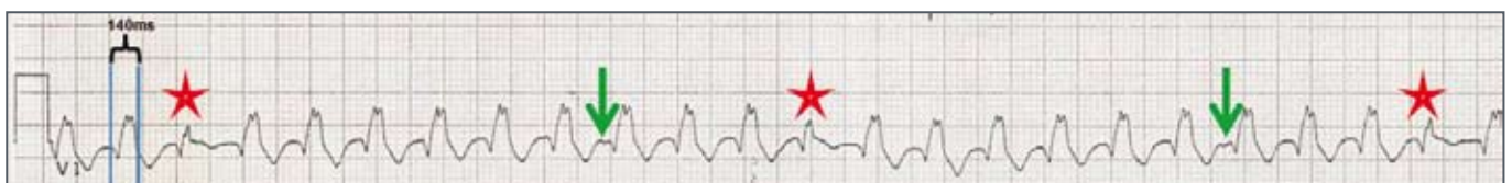
FIGURE 1: VI rhythm strip from 12-lead ECG

These differential diagnoses were easily excluded in this patient: He was not being paced. His pre-op ECG showed no evidence of an accessory pathway or Wolff Parkinson White pattern. The appearance of the QRS complexes, although superficially resembling right bundle block because of the predominantly positive QRS in VI, is not typical of real RBBB. Comparison to a