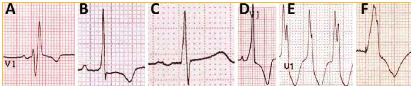
FIGURE 1: Differential Diagnosis of Dominant R in V1