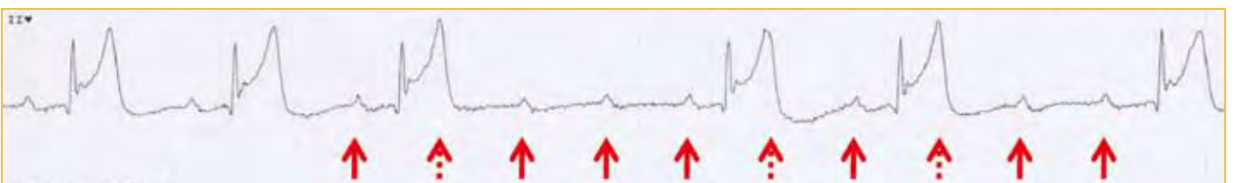
FIGURE 3: Bedside monitor ECG strip with intermittent high degree AV block

Continuous monitoring revealed AV block of higher degree than 2nd degree with 2:1. The solid arrows point to the visible P-waves and the dashed arrows line up with P-waves that are obscured by the T-waves. The arrowed segment shows: 2:1, 4:1, 2:1, 3:1 AV conduction.