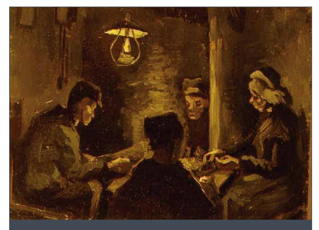
FIGURE 1: The Potato Eaters, sketch by Vincent van Gogh 1885. (in the public domain)

Hatter Cardiovascular Research Institute, Department of Medicine, University of Cape Town and Groote Schuur Hospital, Observatory, Cape Town, South Africa