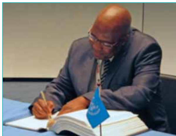
Dr Aaron Motsoaledi, Minister of Health.

South Africa has become the 1st country in the world to sign a new international treaty, the Protocol to eliminate illicit trade in