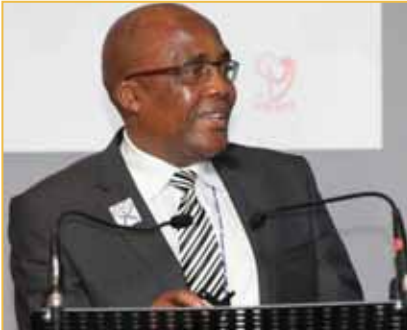
Deputy Minister of Health