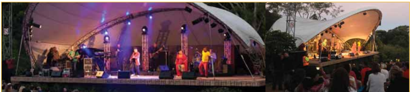
Jonny Clegg at the Kirstenbosch picnic gala