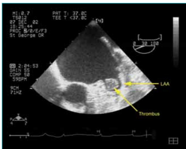
FIGURE 1: Thrombus seen in left atrial appendage on trans-oesophageal echocardiogram.

This trial has not been published yet. The PREVAIL trial was designed to confirm the results of the PROTECT-AF trial and validate the safety of the implant procedure, as requested by the FDA due to concern of safety events during implantation seen in the Protect-AF study. A total of 407 patients were randomised 2:1 device vs. warfarin control. Patients enrolled must have been warfarin eligible and have a CHADS 2 score of ≥2. Procedural safety events occurred in only 2.2% of patients receiving the device. Pericardial effusion occurred in 1.9% of patients. Longer term efficacy outcome data is still awaited.