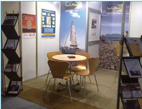
Thanks to the support of SA Tourism, the SA Heart stall at the ESC congress appeared both professional and inviting.

To underline the increased collaboration between the societies – SA Heart being an Affiliated Member of the ESC – the ESC afforded SA Heart a full booth at the recent ESC congress, rather than merely a display panel amongst the other affiliated member countries in a combined exhibition area. SA Tourism came on board and supported designing and print of the booth panels, paying for courier costs and providing South African Tourism DVDs and maps for our stall. The result was an inviting, professional presentation. Pioneer foods kindly sponsored some Safari nuts & raisin packages which we complemented with some packets of fruit dainties to hand out as snacks to the congress goers.