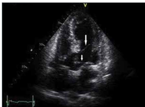
FIGURE 4: Patient B. Apical 5 chamber view illustrating chordal attachments to lateral ventricular wall (long arrow) and AMVL (short arrow) respectively.