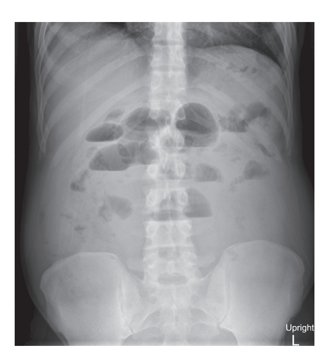
Figure 1, Panel A: Abdominal X-ray showing bowel obstruction.