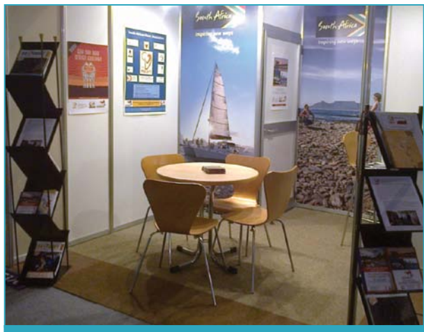
Thanks to the support of SA Tourism, the SA Heart stall at the ESC congress appeared both professional and inviting.

To underline the increased collaboration between the societies – SA Heart being and Affiliated Member of the ESC – the ESC afforded SA Heart a full booth at the recent ESC congress, rather than merely a display panel amongst the other affiliated member countries in a combined exhibition area. SA Tourism came on board and supported designing and print of the booth panels, paying for courier costs and providing South African Tourism DVDs and maps for our stall. The result was an inviting, professional presentation. Pioneer foods kindly sponsored some Safari nuts & raisin packages which we complemented with some packets of fruit dainties to hand out as snacks to the congress goers.