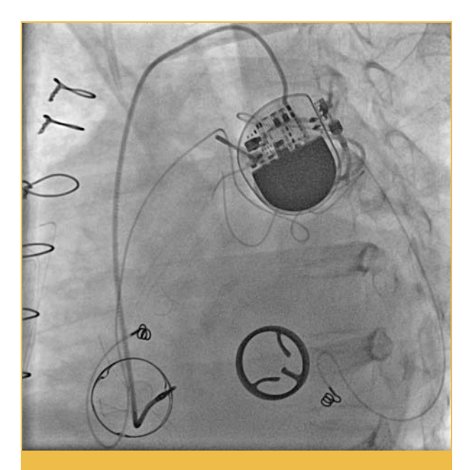
FIGURE 1b: Fluoroscopic left anterior oblique view showing endocardial pacing lead across the bioprosthetic tricuspid valve with pulse generator, mechanical mitral valve and 2 epicardial leads.

of steerable catheters have been described to overcome this issue.<sup>(2)</sup> Insertion of endocardial leads across the prosthetic tricuspid valve may damage the prosthesis.<sup>(3)</sup>