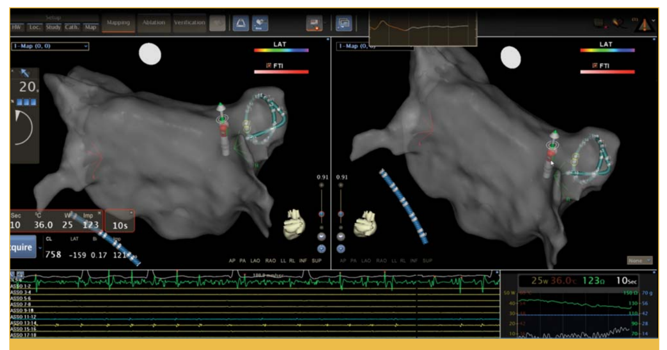
FIGURE I: Different strategies to AF ablation

Both radiofrequency catheter and cryoablation strategies have been associated with major complications including death, stroke, pulmonary vein stenosis, atrio-oesophageal fistula formation and phrenic nerve injury, amongst others. A recent