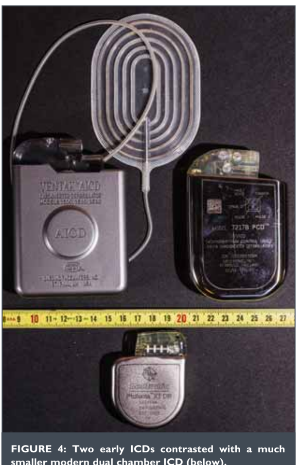
smaller modern dual chamber ICD (below). The patch electrode was sutured directly onto the pericardium over the apex, the second electrode being a transvenous coil in the superior vena cava. Modern systems use a single transvenous electrode, the shock being delivered between the electrode and the can of the ICD.

The field of cardiac electrophysiology is advancing rapidly with improving technology. It is becoming increasingly popular, particularly with the rapid uptake of ablation for atrial fibrillation. In the USA, in 2010, there was one electrophysiologist for every 127 500 people. Most patients with WPW syndrome have had their accessory pathways ablated (the "Wolff" has become an endangered species!). The indications for, and practice of, AF ablation continues to expand. Opportunities for training abound in developed countries and resources allow for relatively unrestricted use of expensive treatments, such as ICDs.