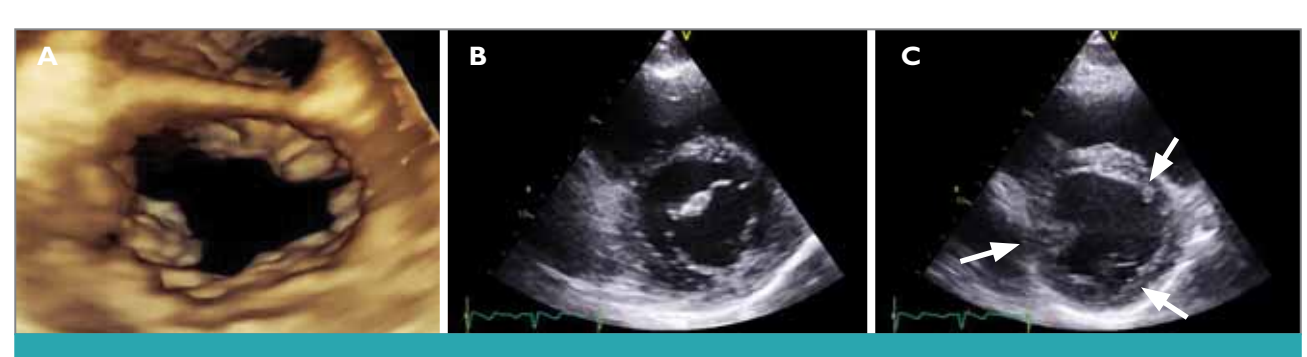
FIGURE 1: A 3D image from patient 1 obtained by TOE clearly shows the novel finding of a tri-leaflet mitral valve (A). Two-dimensional (2D) short axis images taken by TTE show 3 commissures (B) and 3 papillary muscles (C: white arrows).

The third patient is a 50-year-old male evaluated for chronic severe mitral regurgitation. Initially this was assessed as being due to prolapse, but more careful scrutiny confirmed a dilated, well functioning left ventricle with severe mitral regurgitation due to a tri-leaflet mitral valve (Figure 3a and b). Again there were 3 papillary muscles present (Figure 3c): a rudimentary basal medial PM, an anterolateral PM and a more apical posterior PM. Three-dimensional (3D) TOE echocardiography clearly showed the 3 commissures (Figure 3a).