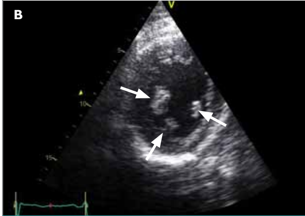
FIGURE 2: Short axis images obtained from patient 2 by TTE shows 3 commissures (A) and 3 papillary muscles (B: white

A literature search revealed only 4 case reports of this finding. The first case was a 13-year-old girl with a tri-leaflet mitral valve as well as severe subaortic stenosis. The presence of 3 papillary muscles associated with the mitral valve were also noted with mild regurgitation of the tri-leaflet mitral valve. The other 5 cases all occurred in the presence of hypertrophic obstructive cardiomyopathy with the MR ranging from mild to severe. The presence of 3 associated papillary muscles was confirmed in one case report, but its presence/absence was not reported on in the other 4 cases. These 5 cases were all identified incidentally on intra-operative trans-esophageal echo-cardiography (TOE)/3DTOE during surgical myectomy and it is therefore unclear if there is a true association.