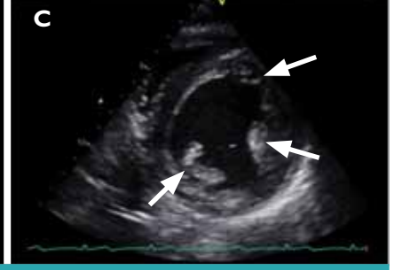
FIGURE 3: A 3D image obtained by TOE from patient 3 again shows 3 commissures (A: white arrows). This can also be seen on the short axis taken by TTE (B) with again 3 papillary muscles clearly visible (C: white arrows).