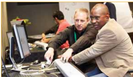
Delegates try out the radial simulator

One of the Course highlights was a special focus on radial PCI, with 2 workshops on each day dedicated to how to start a radial programme, and the tips and tricks needed to succeed with radial PCI. The workshops were sponsored by Terumo, who complemented them with a model of radial access and a radial simulator which proved to be an irresistible key attraction.